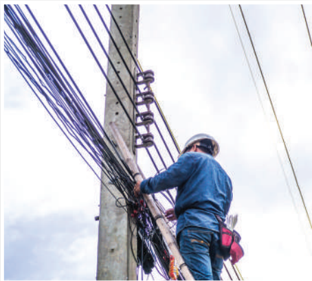
Fiber Optics Technician